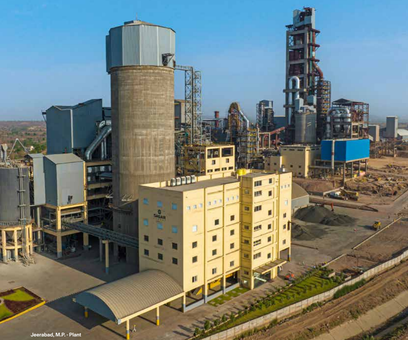
Jeerabad, M.P. - Plant

We are a leading cement manufacturer with our base in the Krishna river belt in southern India. Over the past four decades since our establishment, we have earned a strong brand leadership in our areas of operations. In recent years, we have expanded our footprint by undertaking greenfield expansions in Madhya Pradesh and Odisha, which competitively positions us to serve the rising demand for building materials in Central and Eastern India.