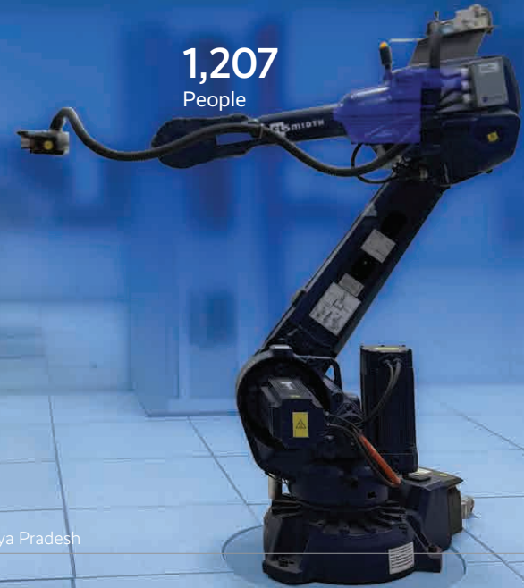
Robo lab at Jeerabad Plant, Madhya Pradesh