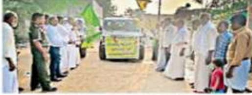
జెండా ఊపి వాహనాలను ప్రారంభిస్తున్న గ్రామపెద్దలు, పరిశ్రమ ప్రతినిధులు

యాడికి, న్యూస్ టుడే: మండలంలోని కుందనకోట గ్రామానికి చెందిన విద్యార్థులకు ఉచితంగా వాహనాల సౌకర్యం ఏర్పాటు చేసే నట్టు సాగర్ సిమెంటు పరిశ్రమ యాజమాన్యం తెలిపారు. సోమవారం గ్రామంలో గుడిపాడు