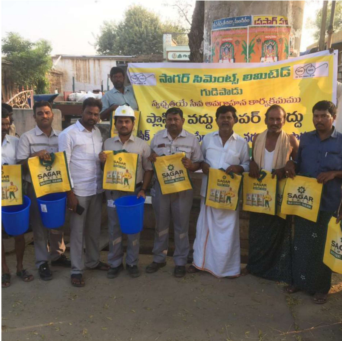
Picture showing Plastic awareness program