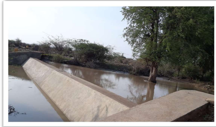
Pic: Showing Check dam at South side of Mines lease area.