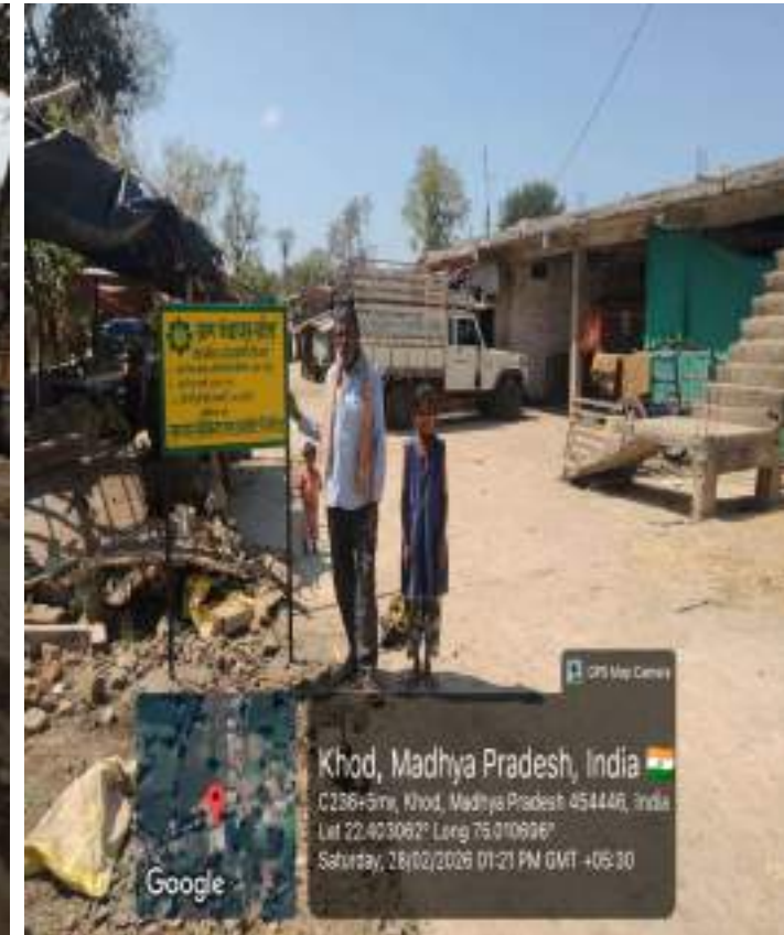
Construction of 100 meter Cement Concrete road at village Khod.