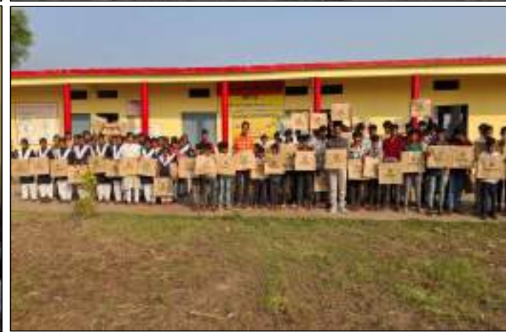
Constructed statue of Bheel freedom fighter "Tantya mama" at village Jeerabad, Donated 310 Jute bags to school students of Govt. School Jeerabad, Karondiya & Bekliya.