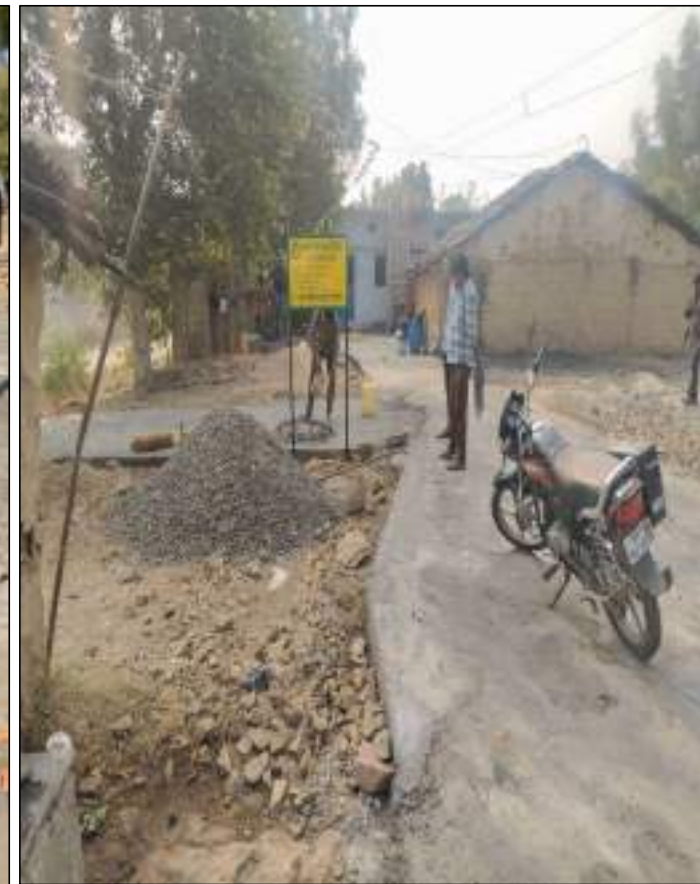
Construction of 170 meter Cement Concrete road at village Karondiya