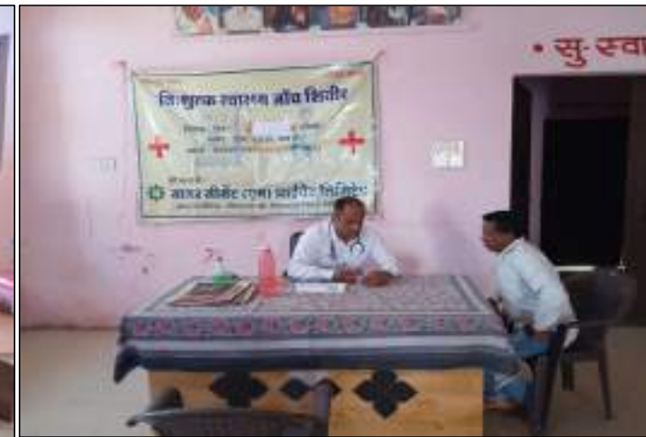
Support to Health & Medical Services- 31 nos free medical checkup and free medicine distribution camp organised at Ghursal ,Rodada, Jeerabad panchayat, Bekliya Village, Khod Village and Badiya Village.