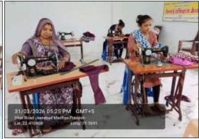
Establishment of skill development center at Jeerabad for training of stitching to local women & girls through hired trainer