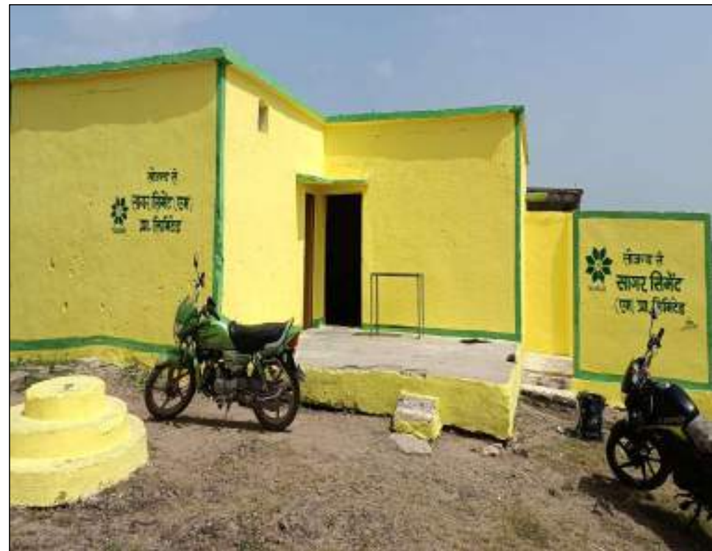
Wall painting of Govt. Primary School, Ghursal