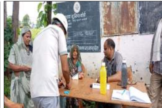
Support to Health & Medical Services- 31 nos free medical checkup and free medicine distribution camp organised at Ghursal ,Rodada, Jeerabad panchayat, Bekliya Village, Khod Village and Badiya Village.