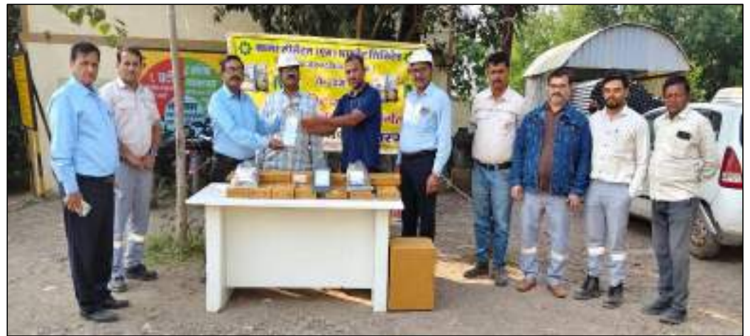
Constructed 02 nos Vermi Compost Tanks for wet & dry organic garbage at Jeerabad Govt. Hr. Sec. School Donated of 40 nos LED Lights to Bekliya & Rodada Gram panchayat