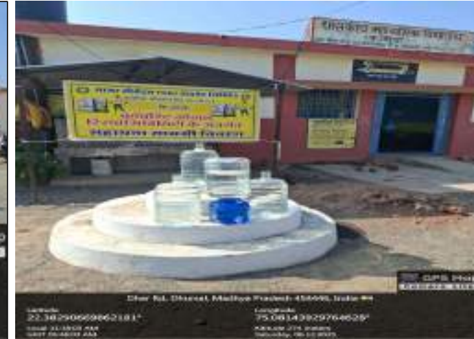
Constructed cemented water storage tank at jeerabad police chowki and Rodada village, Cleaning & maintenance of Sironj Tank Canal at Bekliya mine provision of agriculture water to farmers, Water Bottle Jar distribution at Govt. Middle School Karondiya