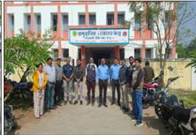
Support to Health & Medical Services- Organised Blood donation camp on the occasion of World Blood Donor day, 200 nos Food basket kit donated to TB patients at Gandhwani Samudai Swasth Kendra