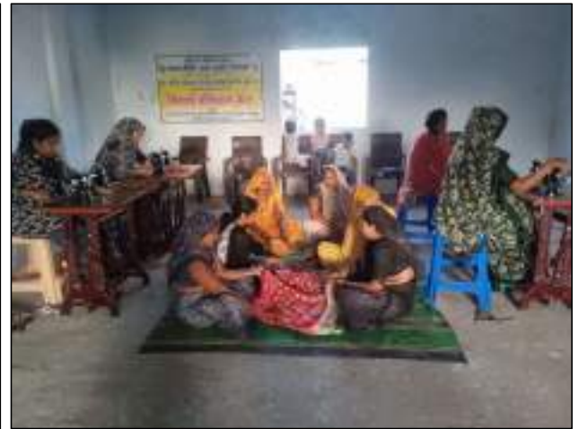
Establishment of skill development center at Jeerabad for training of stitching to local women & girls through hired trainer