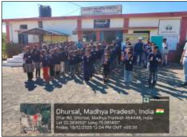
Installation of 04 nos CCTV Camera at Jerabad Bus Stand, Distributed 97 nos sweaters to students of Govt School Karondiya